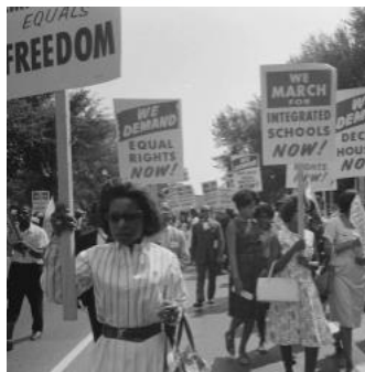
Black History Month