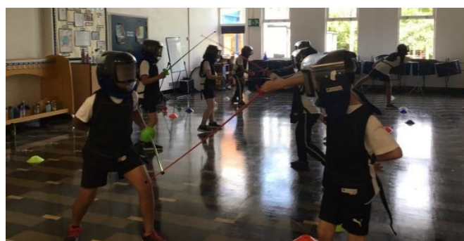
Learning how to duel in fencing and how to play tennis

Another popular sport during the week was Ultimate Frisbee. One child said that "frisbee was my favourite sport in sport's week". The children were taught to aim the frisbee at a target. Everyone loved it!