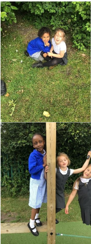
Having fun together!