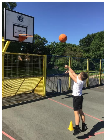
Learning how to play basketball and rugby