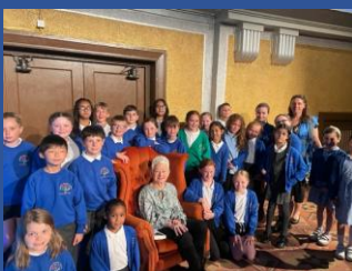
Outwood got to meet lots of famous authors including Dame Jaqueline Wilson