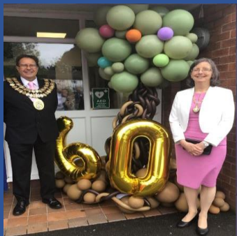
Outwood celebrated its 60 th birthday in style!