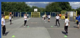
Outwood retained its Gold Award for sport! With the school taking part in lots of sporting events over the year