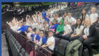
The choir sang as part of the world's largest choir event at the AO arena